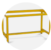
SafeStor Stand HCS2