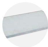
SafeStor shelf SHE-HFC-C